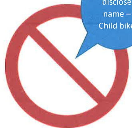
Unable to disclose name – Child bike