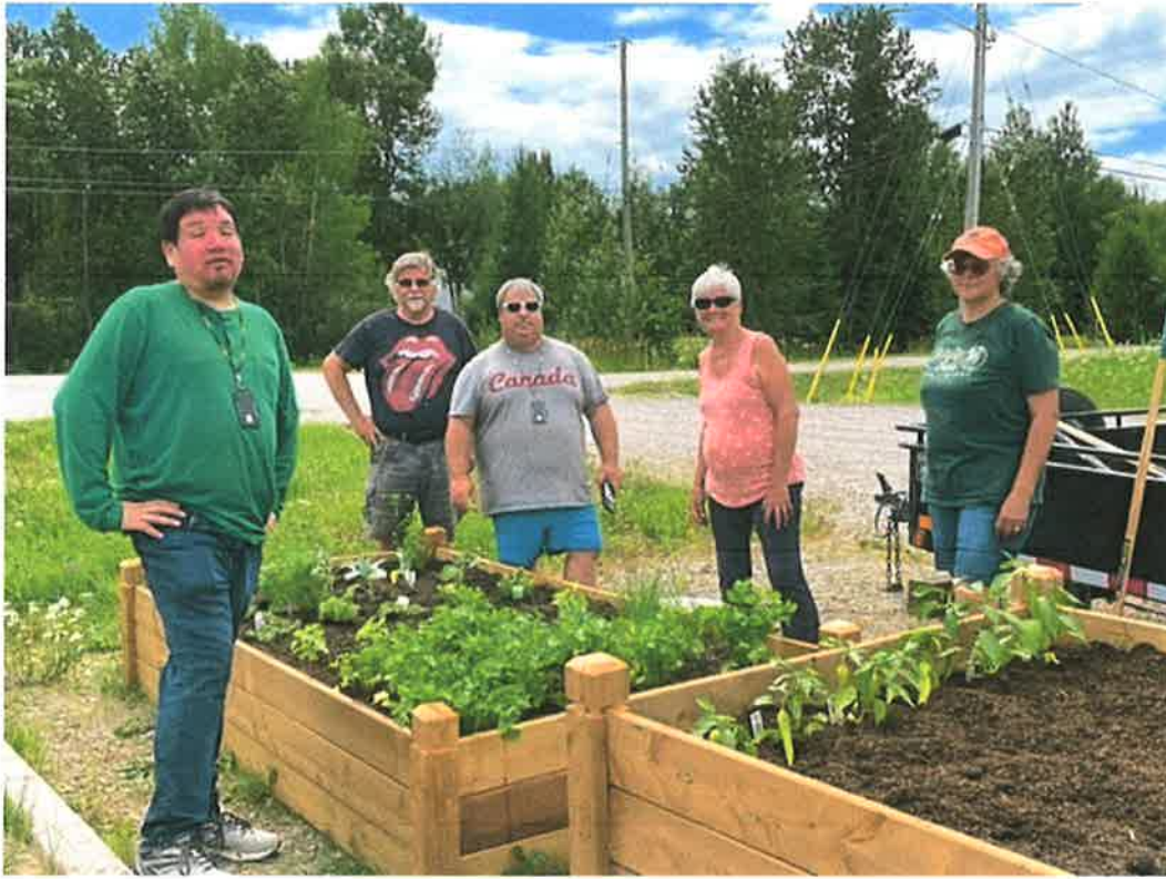
Plant day at Old Garden River Road Community Garden location