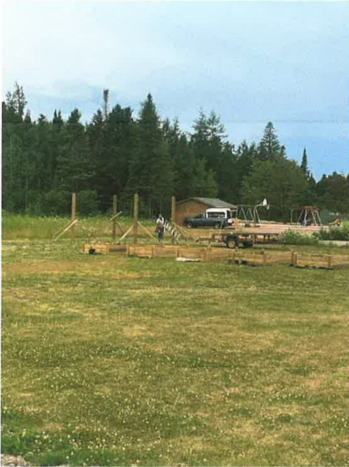
Just getting started at Rankin Community Garden