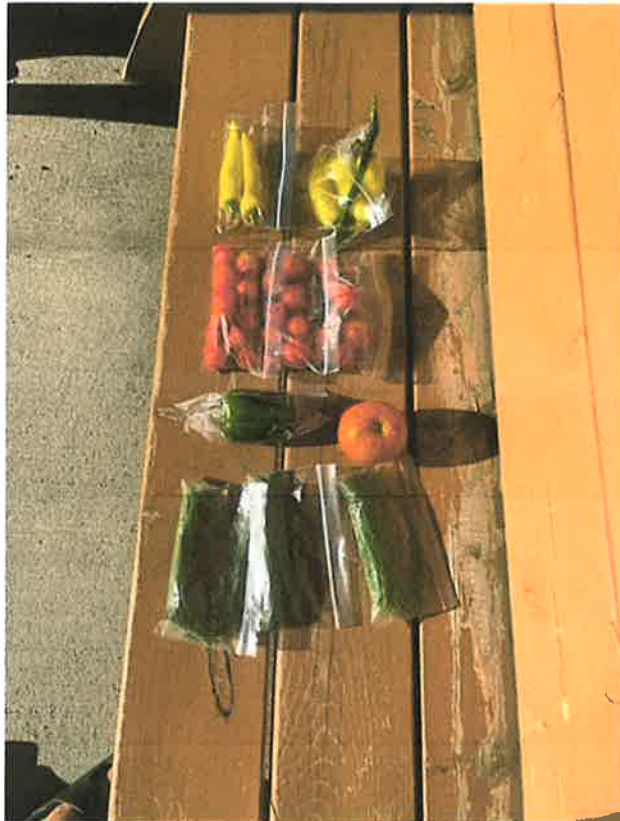
Our First Harvest at Rankin Community Garden

Tomatos, hot peppers, chives, sweet peppers and green pepper