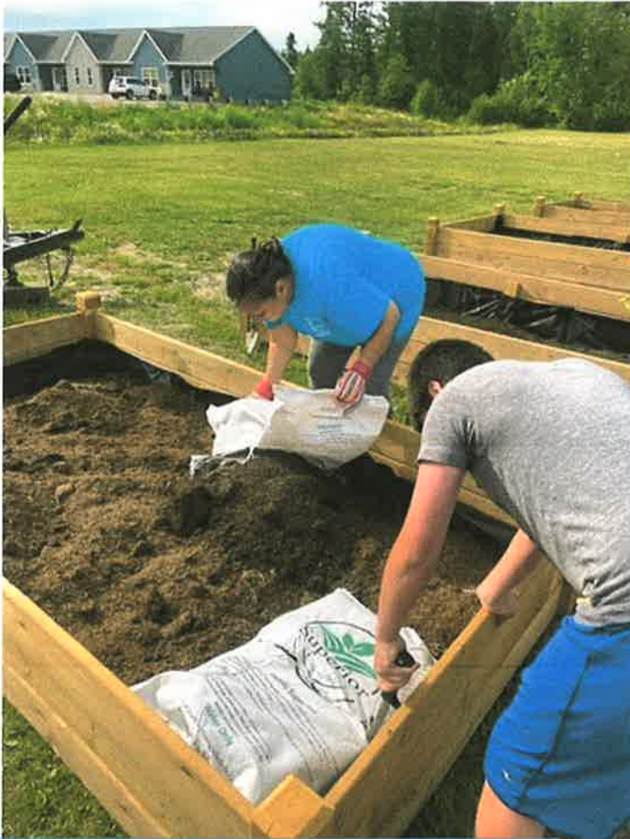
Filling the beds with soil!!