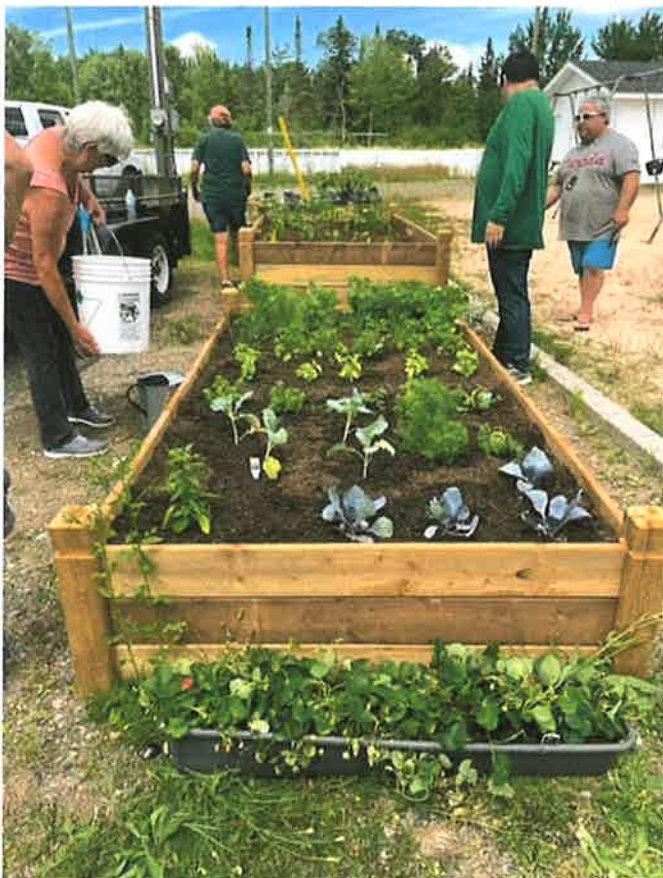
Plant day at Old Garden River Road Community Garden location

Tomatos, hot peppers, chives, sweet peppers and green pepper