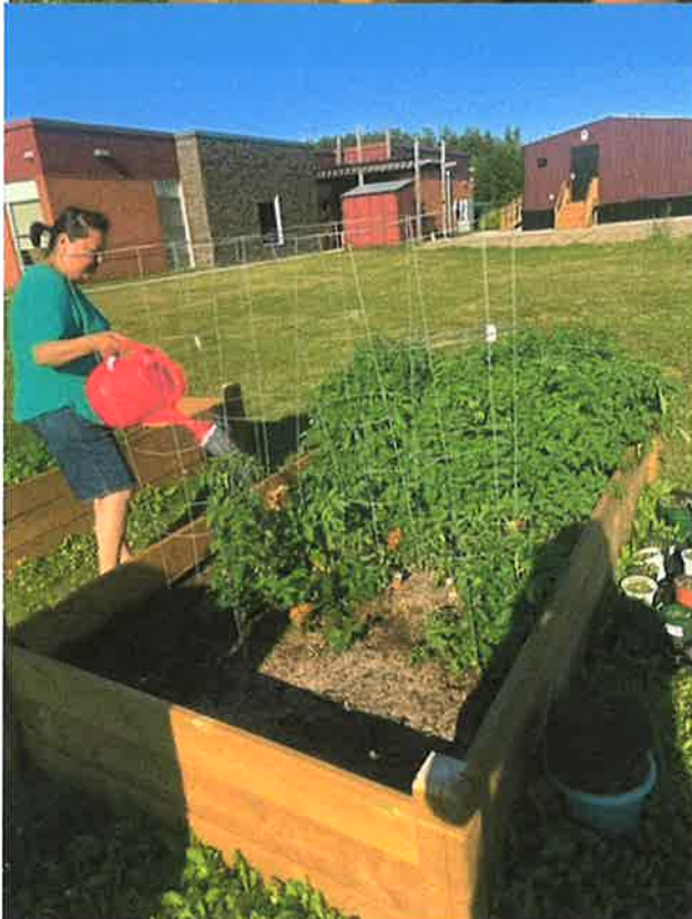
Rankin Community Garden – watering our plants